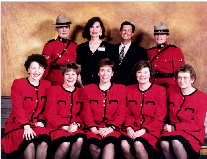
World champion curling team (1994)