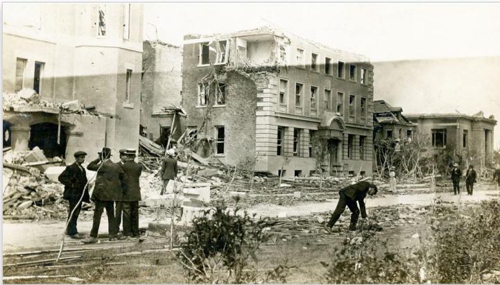
Cyclone damaged buildings (1912)

Future uses for ArchivEra are likely to include making use of the reporting functionality, leveraging the request-tracking module to avoid reinventing the wheel, and expanding usage of the system by sharing it with other city departments, such as the Civic Art Program.